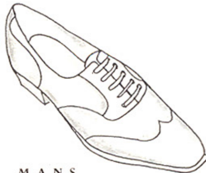
MANS CORRESPONDENT Ref 108