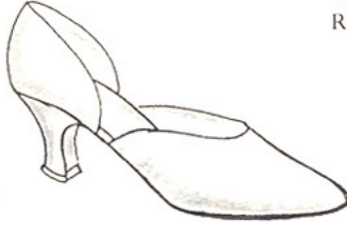
D'ORSAY COURT Ref 104