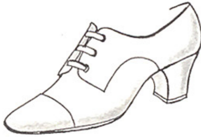
LADIES GIBSON Ref 101