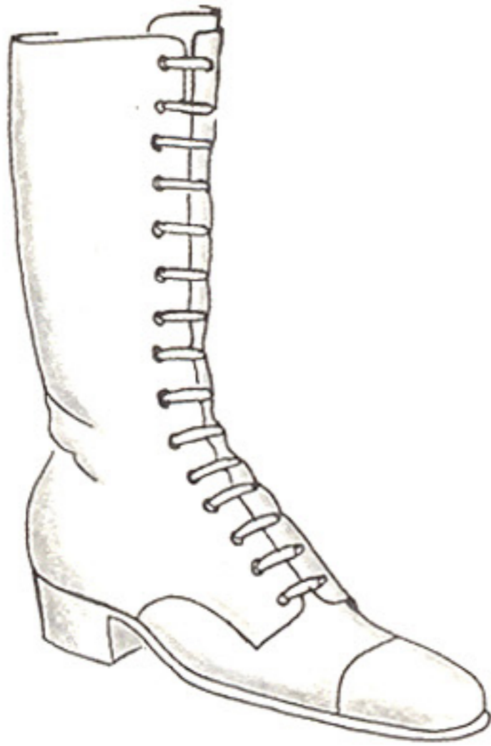
LADIES LACE-FRONT WALKING BOOT Ref 103