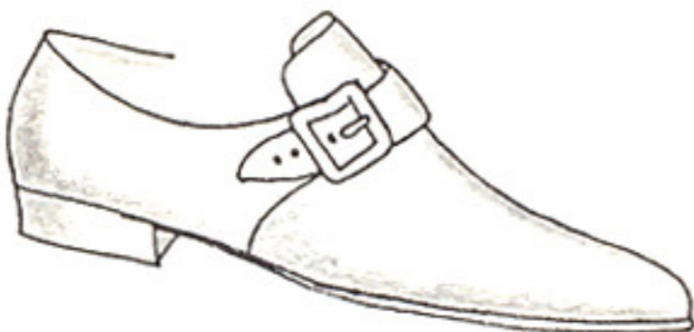
MONK SHOE Ref 109