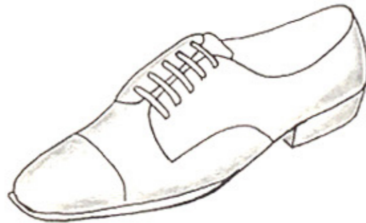
MANS GIBSON Ref 107