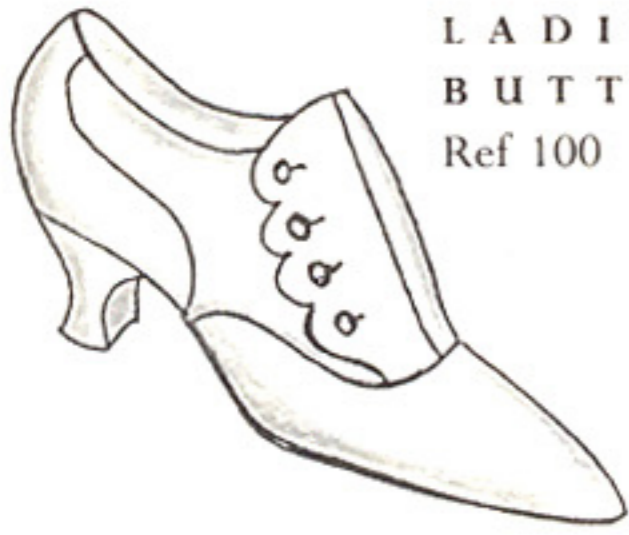
LADIES BUTTON SHOE Ref 100