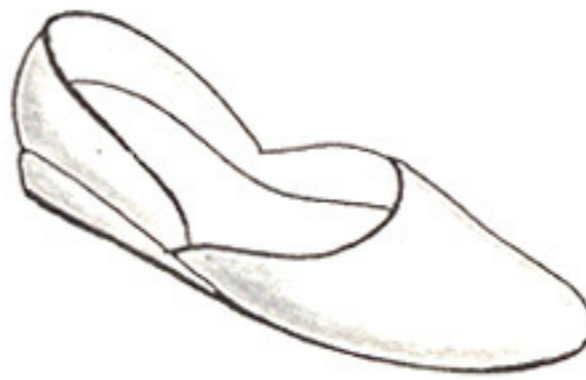
MANS SLIPPER Ref 105